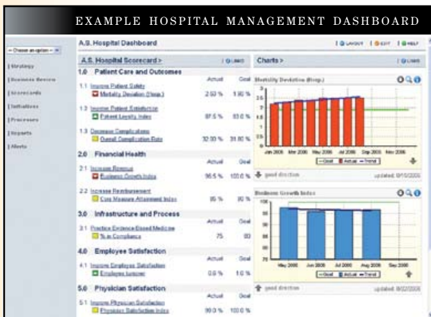
Targeted stakeholder objectives and critical measures – users simply click to drill down into the next level of detail and identify root causes of under performance.

Deployed as an internal intranet web solution, ActiveStrategy Enterprise is used by an organization's real business users – not just analysts or decision support groups – to manage performance and drive results. ActiveStrategy Enterprise delivers customized web-based scorecards or dashboards and performance insights directly to the people who need them.