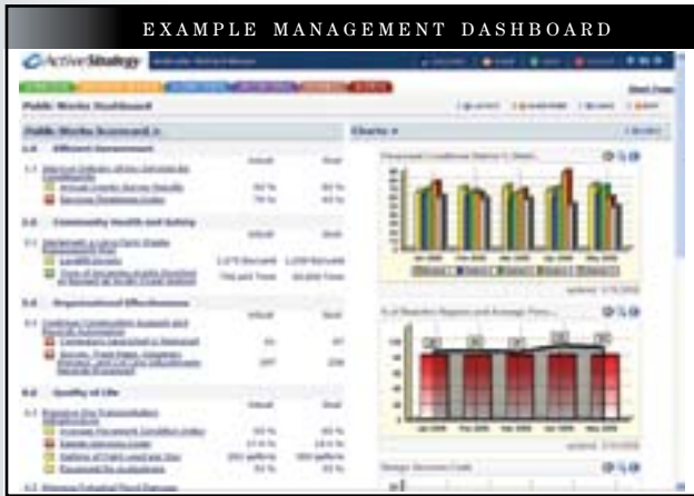
Targeted stakeholder objectives and critical measures – users simply click to drill down into the next level of detail and identify root causes of under performance.

Deployed as an internal intranet web solution, ActiveStrategy Enterprise is used by an organization's real business users – not just analysts – to manage performance and drive results. ActiveStrategy Enterprise delivers customized web-based scorecards or dashboards and performance insights directly to the people who need them, including CEOs, city/county managers, executive teams, senior and middle management, and front-line employees.